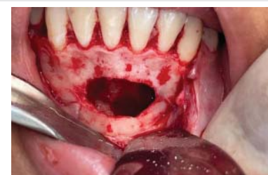
Figure 7: Bone osteotomy, removal, and curettage of the cyst.