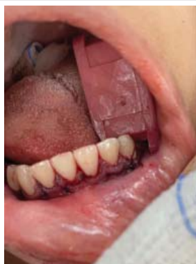
Figure 10: Inter papillae sutures of the gingival tissue (immediate post op.).