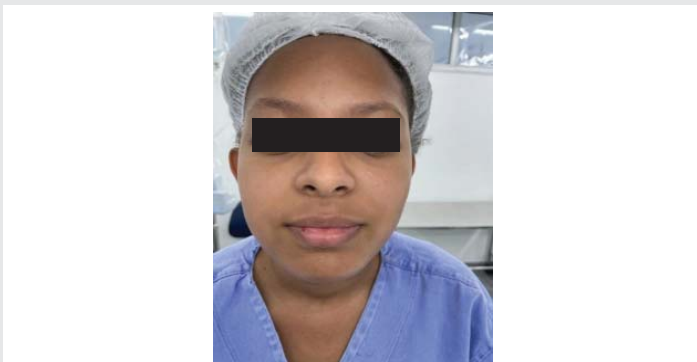
Figure 1: Frontal view of the patient