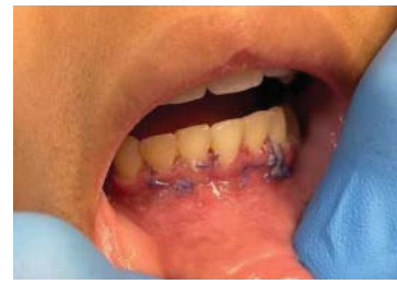
Figure 11: 15 days of post-operative.