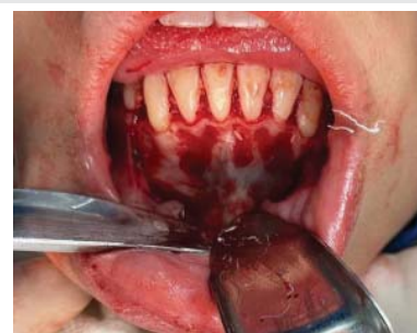
Figure 6: Detachment of the gingival tissue to expose cyst..