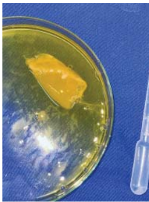
Figure 8: PRF membrane in a glass recipient after the blood centrifugation.

A follow-up session was conducted for 15 days postoperatively, with no complications observed (Figure 11). A new panoramic X-ray taken six months later showed complete bone healing and new bone formation in the treated area (Figure 12).