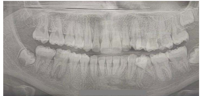
Figure 12: OPG X-ray showing the wound healing and bone growth in the mandibular area between 22 and 28 dental elements.

In recent times, the domain of wound healing management has evolved, incorporating methodologies centered on tissue engineering. Presently, advancements in biomaterials and a more profound comprehension of the wound-healing cascade have led to the development of numerous innovative therapies and strategies. Regrettably, the majority of these interventions are prohibitively expensive for widespread application across all patient populations and do not consistently ensure efficacy [4].