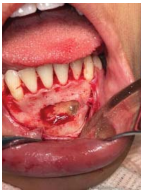
Figure 9: PRF membrane inserted in the osseous defect to promote wound healing.