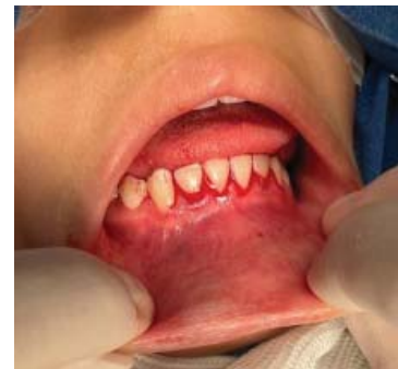
Figure 5: Intra oral sulcular incision.