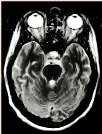
Figure 3: Axial T2-weighted post contrast-enhanced MRI shows optic nerve enhancement bilaterally.

neuritis includes papilledema, infiltrative optic neuropathy, toxic/nutritional optic neuropathy and, hereditary optic neuropathy [8]. In papilledema, the vision is initially normal, and the visual field may be normal or with an enlargement of the blind spot. Orbital lesions compressing the optic nerve and infiltrative disease of the optic nerve may cause disc edema and visual loss. Toxic or nutritional optic neuropathies are notable for a normal optic disc or mild temporal pallor. Leber's hereditary optic neuropathy typically affects males between 10 and 30 years of age, and Kjer dominant optic atrophy affects males and females between 4 to 8 years of age. Most cases of optic neuropathy in patients with HIV infection are associated with opportunistic infections as systemic viral diseases such as hepatitis B virus infection, herpesviridae family or bacterial diseases, as Lyme disease, tuberculosis and syphilis. Evaluation of visual loss in patients with AIDS is complex, requiring investigation of infectious causes. The proposed mechanisms for the clinical findings of the HIV-