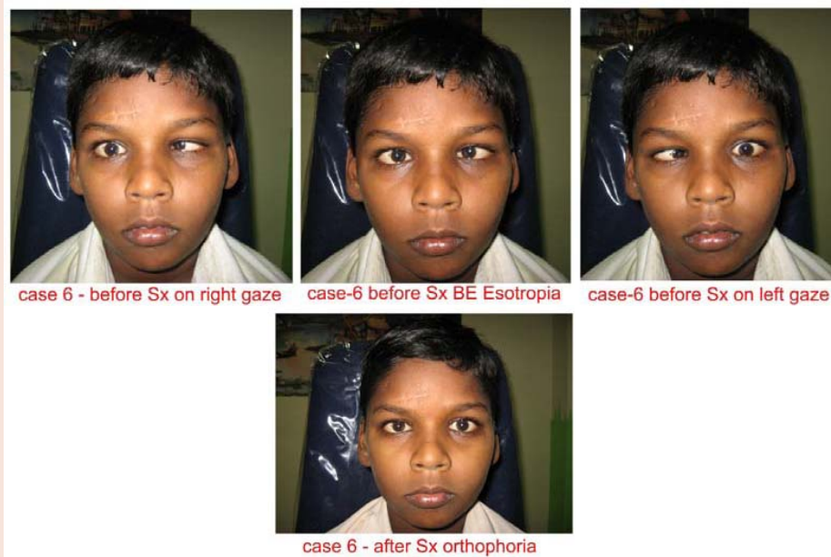
Figure 6: Case 6 before and after surgery.

movements may indicate that the patient falls into the subgroup where there is primarily an innervational cause. The first sign is the pattern of a gradual movement of elevation or depression. The vertical deviation steadily increases as the affected eye moves from abduction to primary position and into adduction. By contrast, in the mechanical form the eye usually remains in the horizontal plane or close to it, as the eye moves into adduction. And the flip-up or flip-down is typically abrupt and occurs as the eye rises just above or depresses just below the horizontal plane [10,14,15].