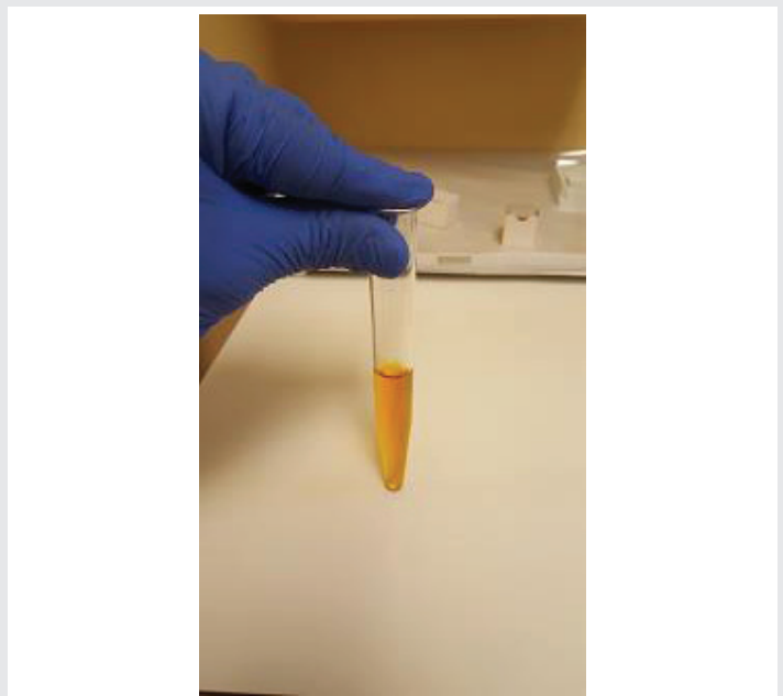
Figure 2: Urine showing orange discoloration.