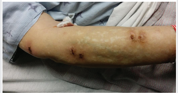
Figure 1: Yellowish discoloration of skin with bull's eye like lesions over right lower arm and forearm.

Given the striking orange discoloration of the urine we asked the patient specifically about phenazopyridine. She admitted using phenazopyridine for urinary complaints due to presumed interstitial cystitis. Phenazopyridine had initially